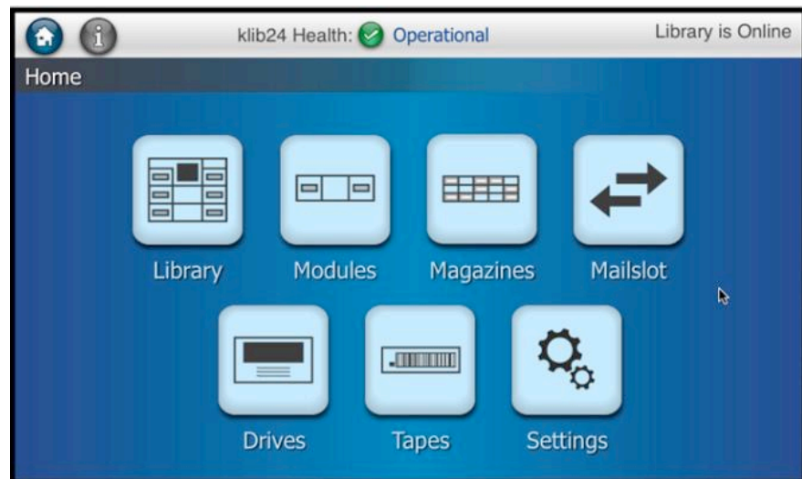
Figure 1. StorageTek SL150 modular tape library touchscreen operator panel

With the StorageTek SL150, simplicity begins with the library installation and continues throughout the life of the product, even as you expand for data growth. The library can be initialized in a few steps via the local touchscreen operator panel, and upgrades are easy because they require no tools, complicated cabling, or technical support.