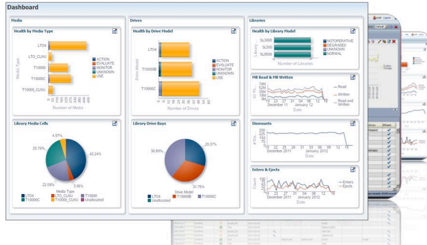
Figure 2. Oracle's StorageTek Tape Analytics software simplifies tape storage management because it takes a proactive approach to eliminate library, drive, and media errors.

For intelligent monitoring of StorageTek tape libraries, StorageTek Tape Analytics software provides tape storage customers with access to leading-edge tape monitoring software that goes far beyond exposing a red, yellow, or green indicator. Rather, StorageTek Tape Analytics software provides insights into hundreds of drive, media, and library health attributes that empower tape storage administrators to make proactive decisions about their tape environments prior to device failures. A proactive approach to managing the health of a tape environment improves the performance and reliability of existing tape investments and helps executives make informed decisions about future expenditures.